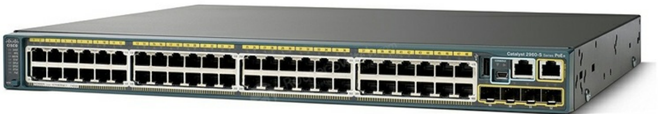
Table 1 shows the Quick Spec of the WS-C2960S-48LPS-L.

Figure 1 shows the appearance of the WS-C2960S-48LPS-L.